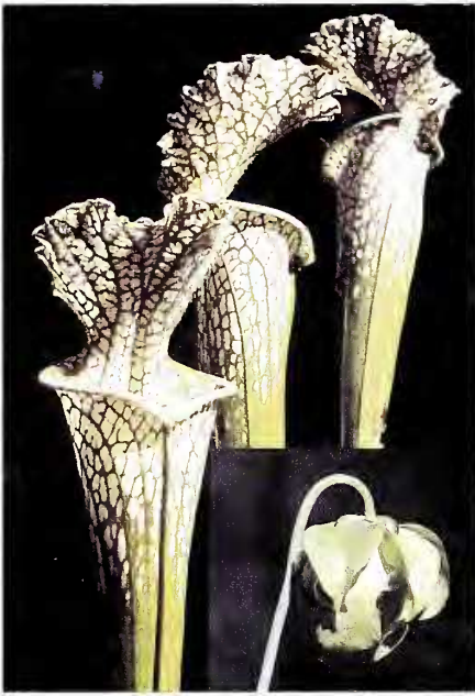
Figure 1. Flower and leaves produced in spring and fall 1994 of the S. leucophylla (green) mutant.